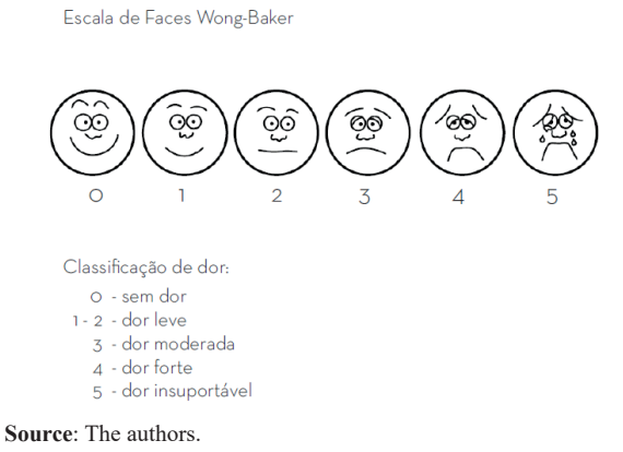
Figure 11 - Wong-Baker Face Scale.

The child was instructed to point to the picture that represents his level of discomfort after the following question: